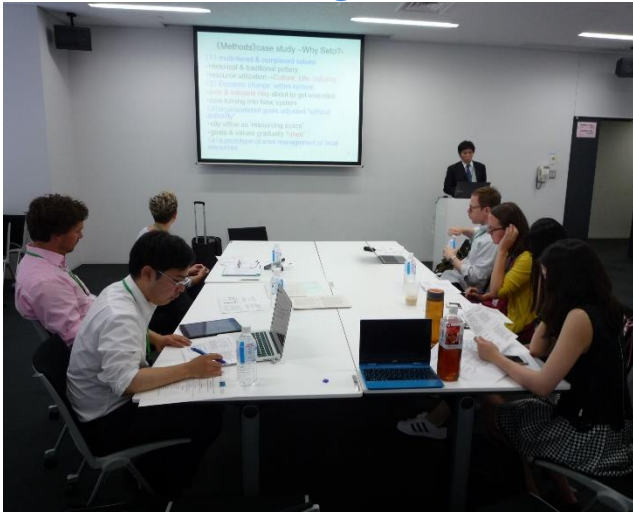
Workshop group 1 11